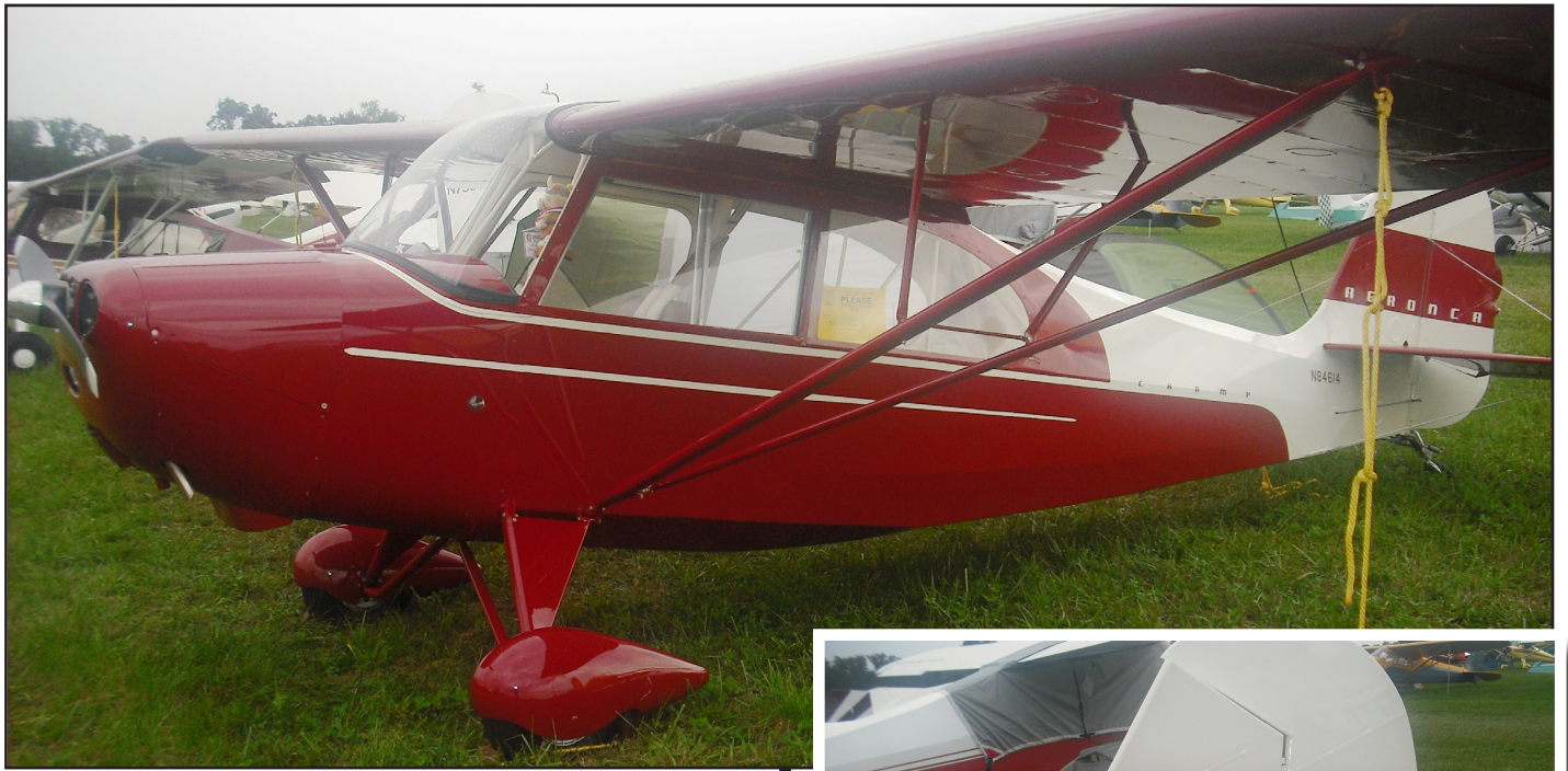
Chapter choice award