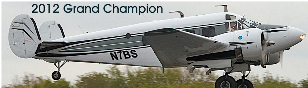
2012 Grand Champion