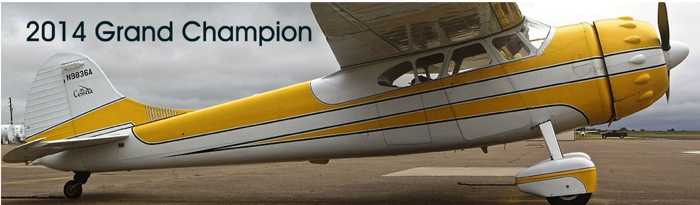
2014 Grand Champion