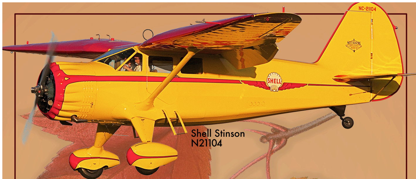
Shell Stinson N21104