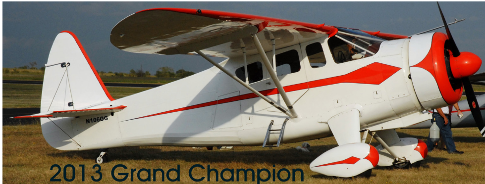
2013 Grand Champion