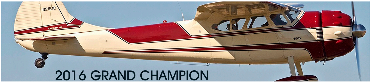
2016 GRAND CHAMPION