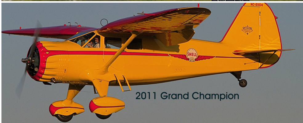
2011 Grand Champion