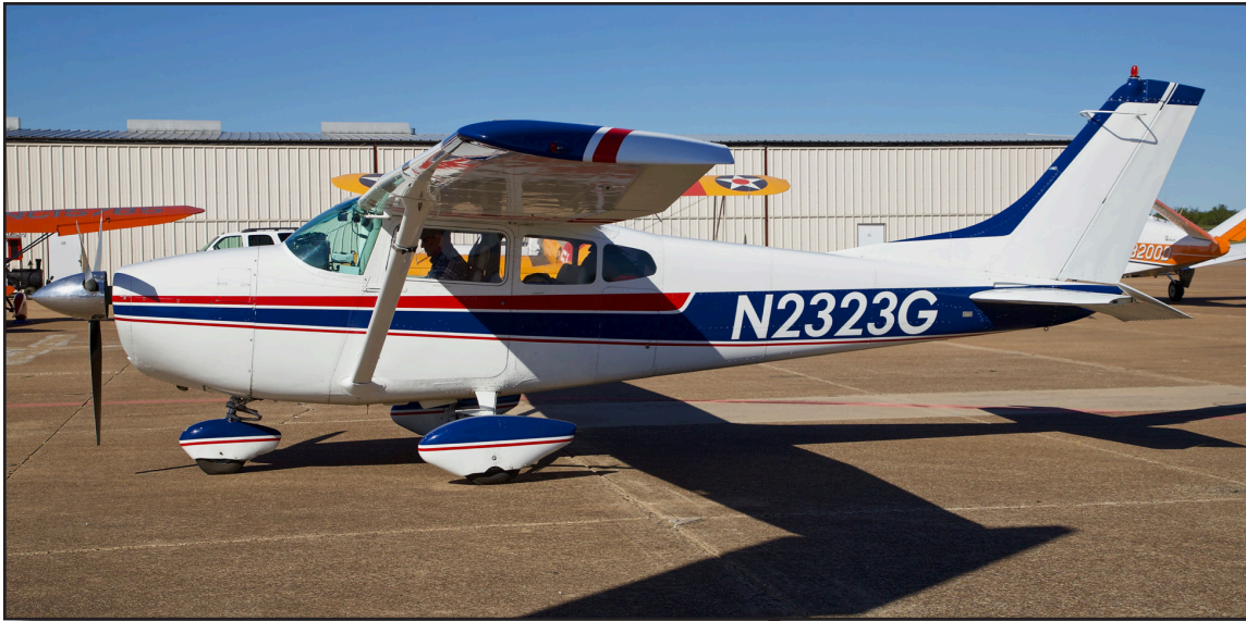
TTXAAA 2019 Best Neo-Classical- N2323G, Cessna 182D, msn 51623, built 1958