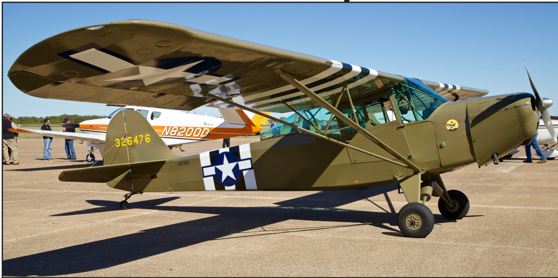
TTXAAA 2019 Best Warbird- N51366, Taylorcraft L-2-D60-65, msn L-5788, built 1943