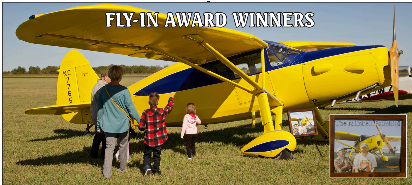
Champion- NC77654, Fairchild 24R-46, msn R46-333, built 1947

TXAAA 2019 Best Antique- NC36692, Aeronca 65-LB, msn L17501, built 1942