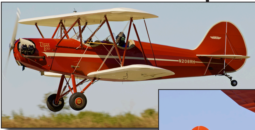
TXAAA 2019 Best Homebuilt- N208RH, Hatz CB-1 (Hansen, Fredrick M), msn 208A