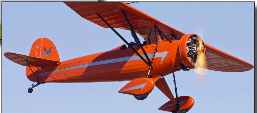
AAA 2019 HQ Award- NC15785, Davis D-1-W, msn 801, built 1935