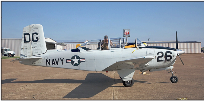
N834G, Beech T-34A (built by Canadian Car & Foundry), msn CCF34-095; ex USAF 53-4126.