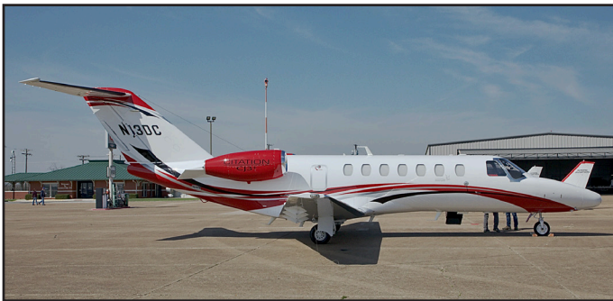
N13DC, Textron 525B, msn-525B-0677, ff 2022.