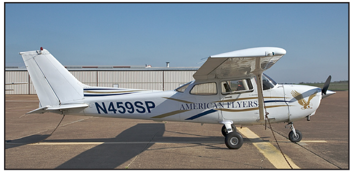
N459SP, Cessna 172S, msn 172S-08325, ff 1999.