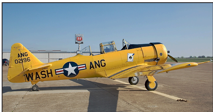
N196FC, North American NA-81 Harvard II, msn 81-41221; ex RCAF BW196.