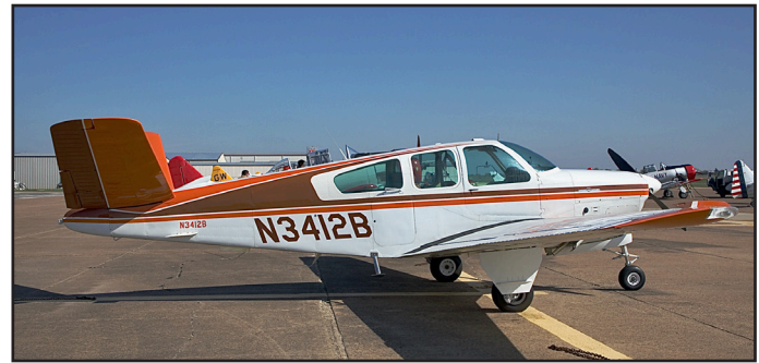
N3412B, Beech Bonanza D35, msn D-03650, ff 1953.