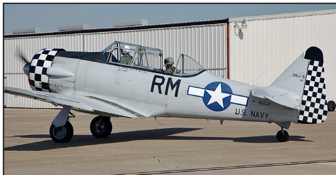
N30JF, North American SNJ-5, msn 88-16411; ex USAAF AT-6D 42-84630, USN 44009, N6639C.