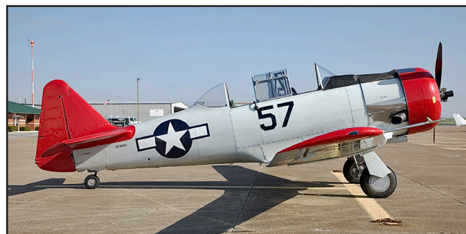
N7460C, North American NA.121: AT-6F, msn 121-42606; ex USAAF 44-81884.

Thanks to aerialvisuals.ca for the history on these T-6 aircraft, as well as the information on the following T-34's. Information on the other aircraft came from the FAA on-line "Aircraft Inquiry" site.