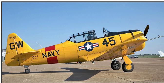
N545GW, North American AT-6 built 1994/5 by Gary A Witford with FAA msn