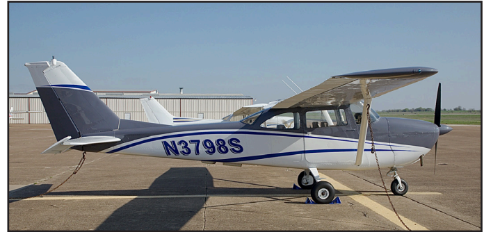
N3798S, Cessna 172E, msn 172-50998, ff ?