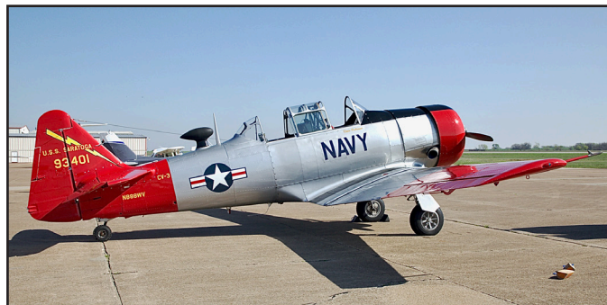
N888WV, North American NA.168: T-6G, msn 168-525, ff 1951; ex USAF 49-3401, Spain AF E.16-115 (coded 74-115, 793-37), N4995P.