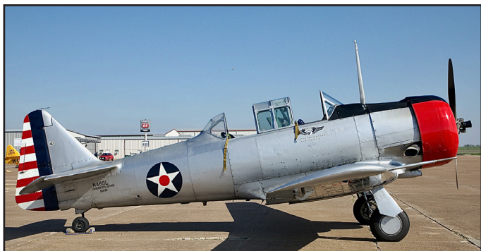
N46SL, North American SNJ-4, msn 88-12028; ex USN 27129.