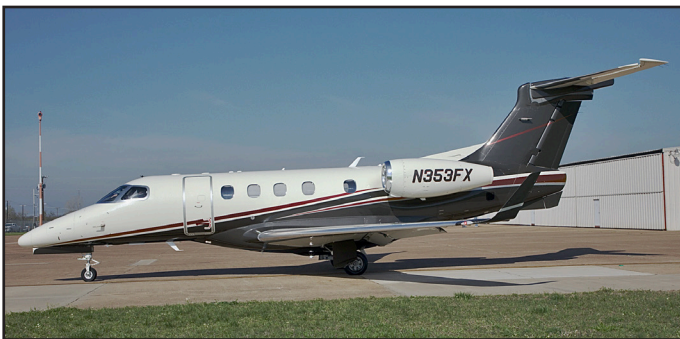
N353FX, Embraer 505, msn 505-00115, ff