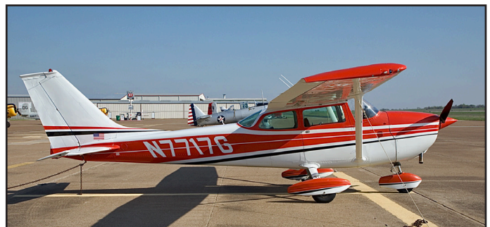
N7717G, Cessna 172L, msn 172-59417, ff 1970.