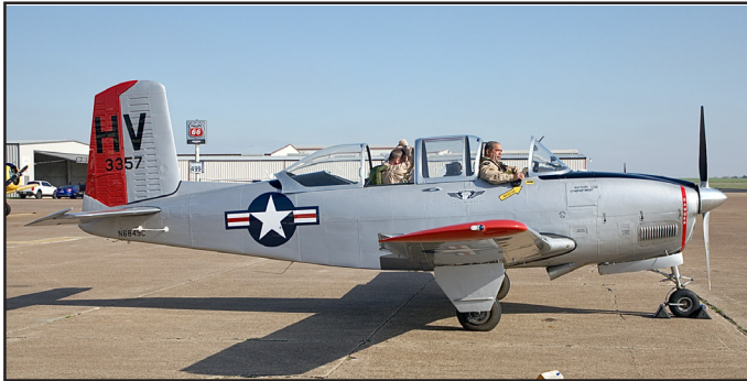
N6849C, Beech T-34A, msn G-118; ex USAF 53-3357.