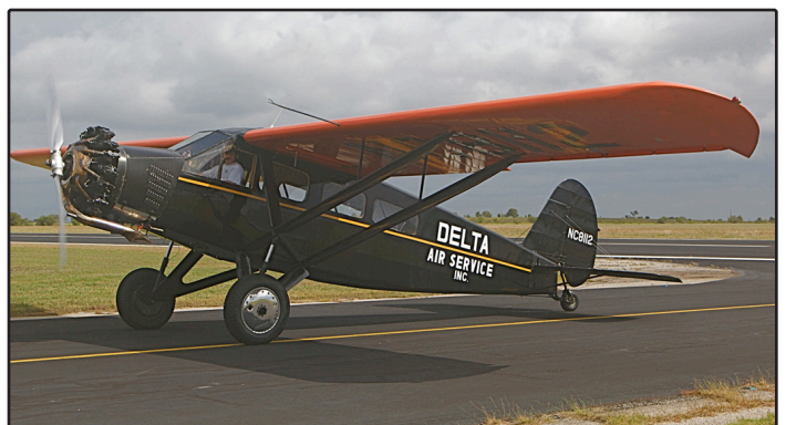
Antique Closed Cockpit, Scott Glover, Mount Pleasant, TX., NC8112, 1929 Traelair 6000