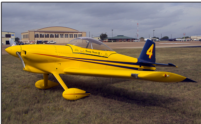
Experimental Kit Built, Shawn Scott, Fort Worth, TX., N123SC, Van's Model RV-4, 2009