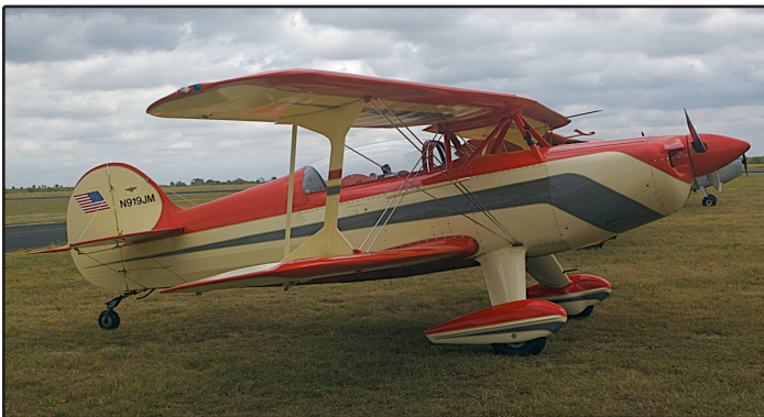
Experimental Plan Built, Rex Heminger, Colleyville, TX., N919JM, 1991 Steen Skybolt-180